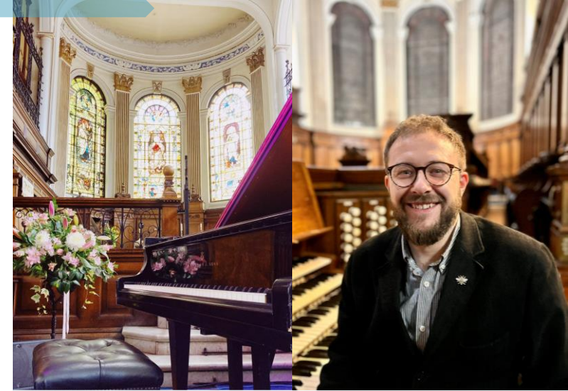
Steinway B Piano

The church is regularly used for concerts by outside groups, including Piccadilly Sinfonietta, Manchester Camerata and Manchester Baroque. We have also welcomed musicians taking part in the Manchester Jazz Festival and other organisations. These events often attract large audiences, which both increases the number of people aware of St Ann's and brings in funds.