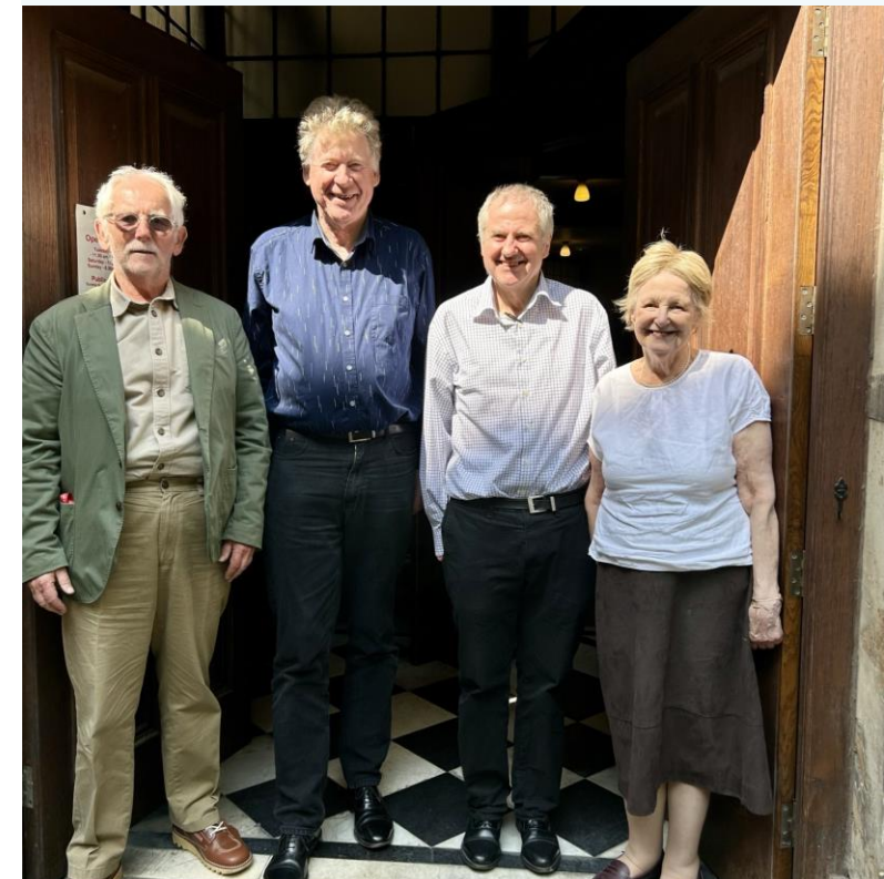
St Ann's Church Wardens