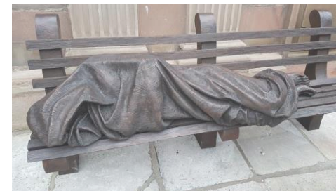
Jesus the Homeless

To show love for our neighbours by challenging injustice and violence as we encounter them.