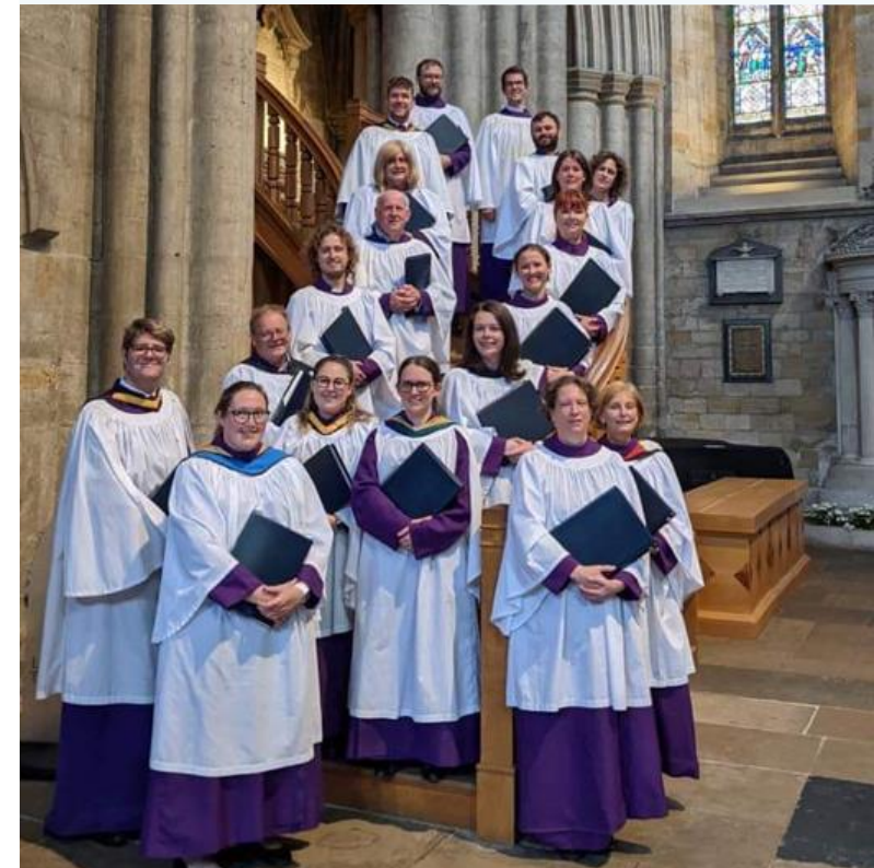
St Ann's Choir on tour in Ripon Cathedral August 2022